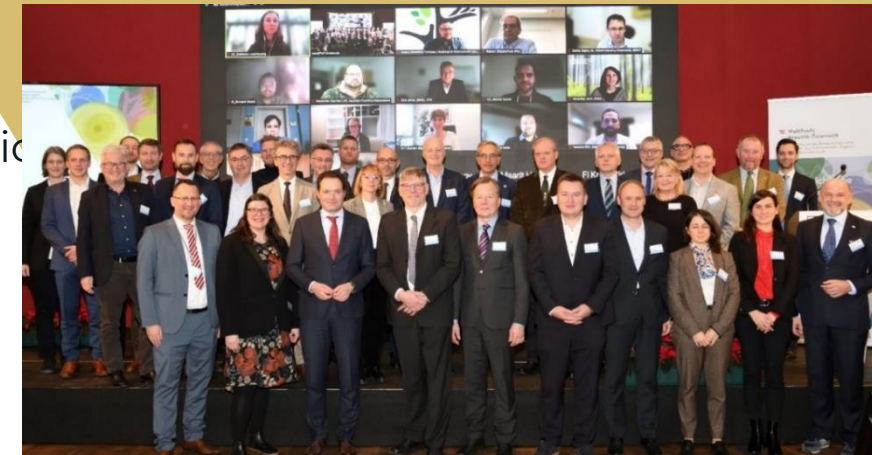
First woodPoP High Level Meeting

Exchange of Views on the priorities of the initiative , Agreement on the Guidelines (structure and working method)