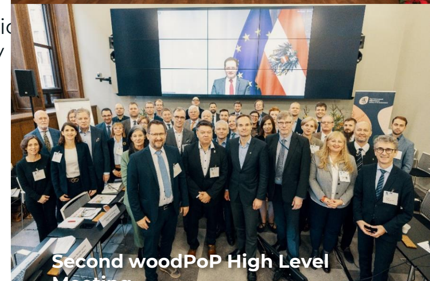
Second woodPoP High Level Meeting